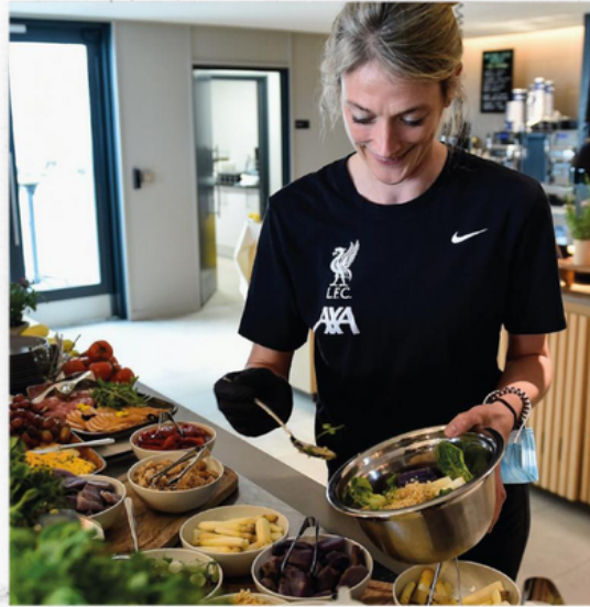
WHAT DOES IT REALLY TAKE?