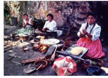
Indigenous Mexicans, making Tamales. The recipes are passed down through families.

Figure 5b – Discussing the complexity of preserving indigenous culture through oral history and colonial sources.