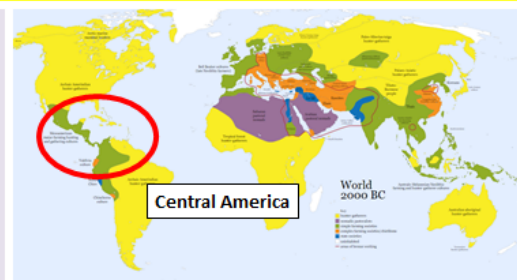
Figure 1c – Situating the Aztec in the polycentric world.

Today, we are going to learn about an Empire from Central America called the Aztec Empire .