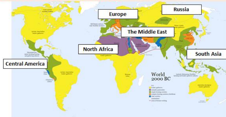
Figure 1b – Establishing the existence of multiple co-existing worlds.

Which parts of the world already had Farming Societies (people stayed in place and grew crops) in 2000BC?