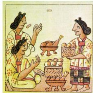
A Spanish image of Aztec women making Tamales