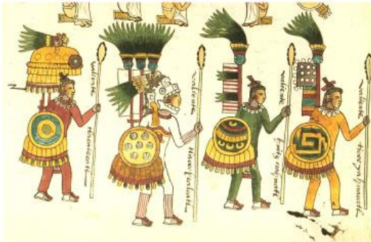
A Spanish image of Aztec Eagle Warriors

Traditional clothing, such as the battle dress of Eagle and Jaguar warriors, are often copied from Spanish sources.