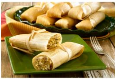
Tamales, a traditional Aztec dish.

Aztec cookery, which is still eaten in Mexico, is understood by a combination of word of mouth, and Spanish sources.