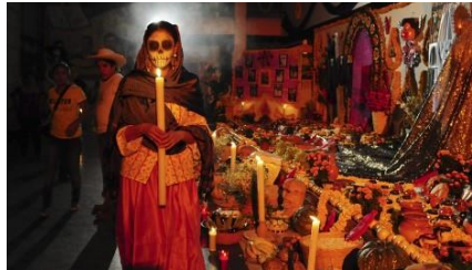
Figures 6c – Investigating the influence of Spanish Colonisation on Culture