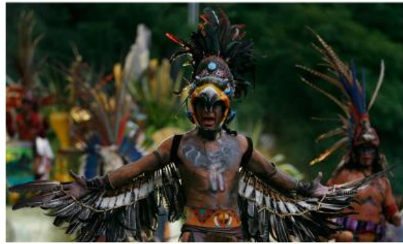
A Modern Aztec Eagle warrior

Figure 5a – Discussing the complexity of preserving indigenous culture through oral history and colonial sources.