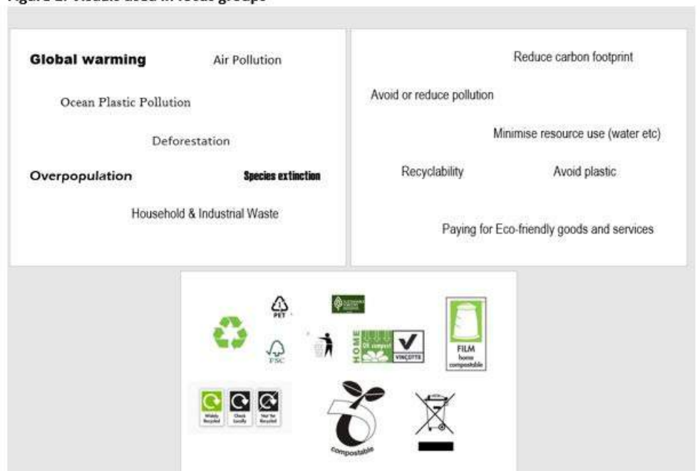
Figure 1: Visuals used in focus groups

Therefore, the first visual offered consumers major environmental issues recognized by scholars and activists. These encompass global warming, air pollution, ocean plastic pollution, deforestation, overpopulation, species extinction and household and industrial waste. The second visual encompassed personal actions to reduce environmental impact and these options included: reduce carbon footprint, avoid or reduce pollution, minimise resource use (water, etc), avoid plastic, recyclability, paying for eco-friendly goods and services. Finally, the third visual provided logos for recycling and handling waste and consumers were asked whether they know what each one means and whether they use them when handling packaging and waste.