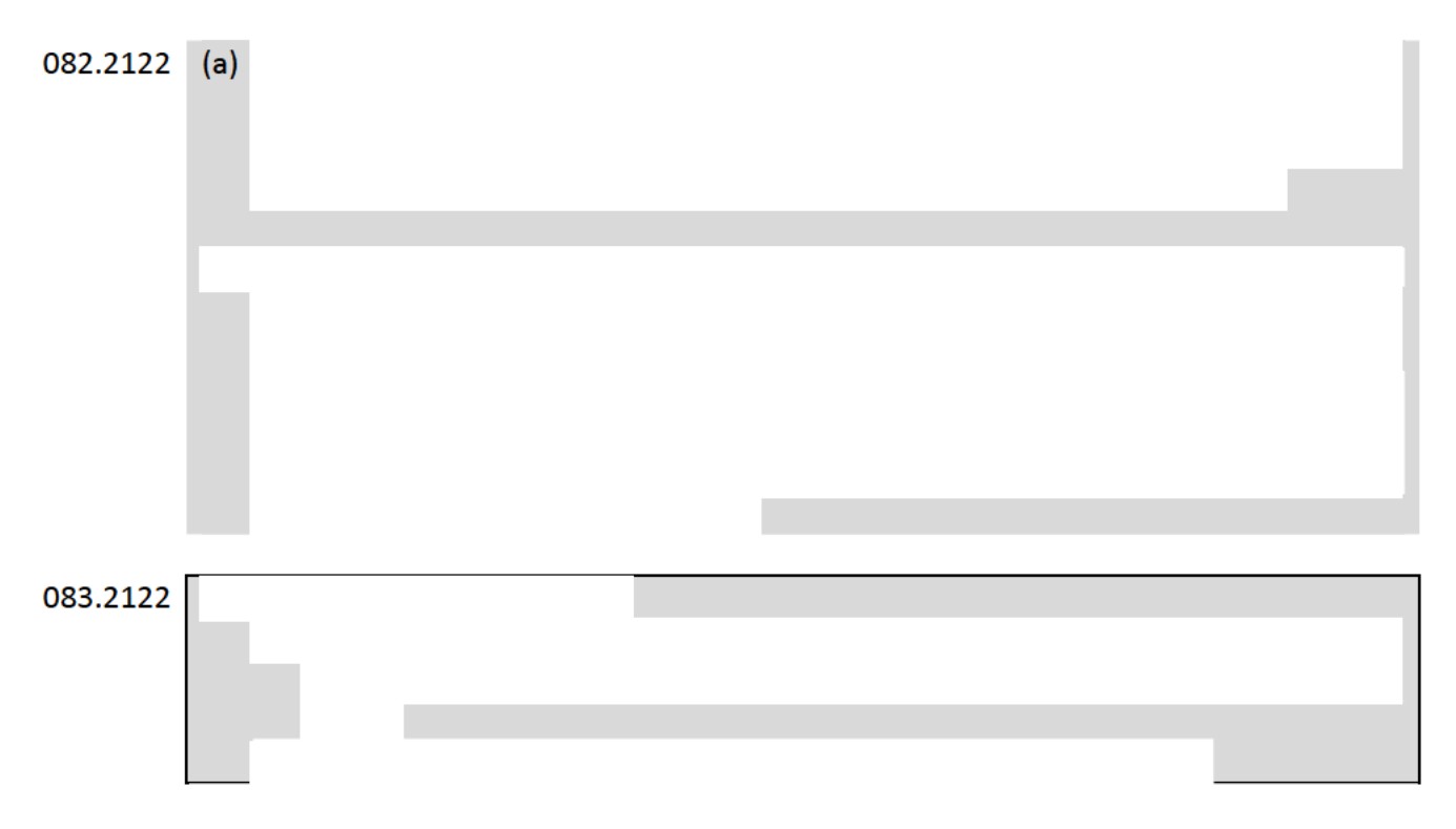
of the Academic Board – 27 April 2022

Minutes 082 and 083.2122 are exempt from publication under the provisions of Section 43 (Commercial interests) of the Freedom of Information Act 2000.