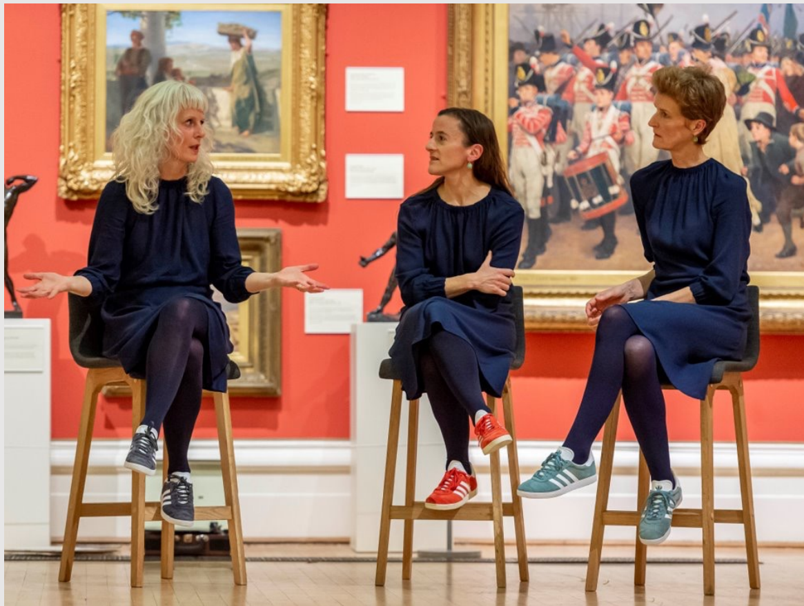
Please Do Touch, Leicester, 2018