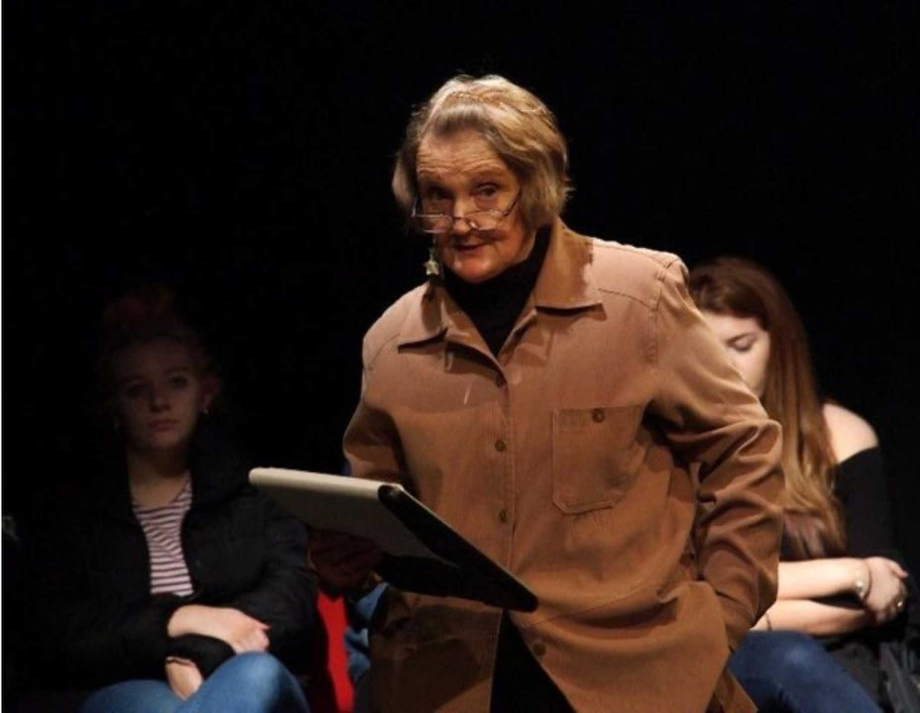
Talkin Bout My Generation show, performed by older adults.