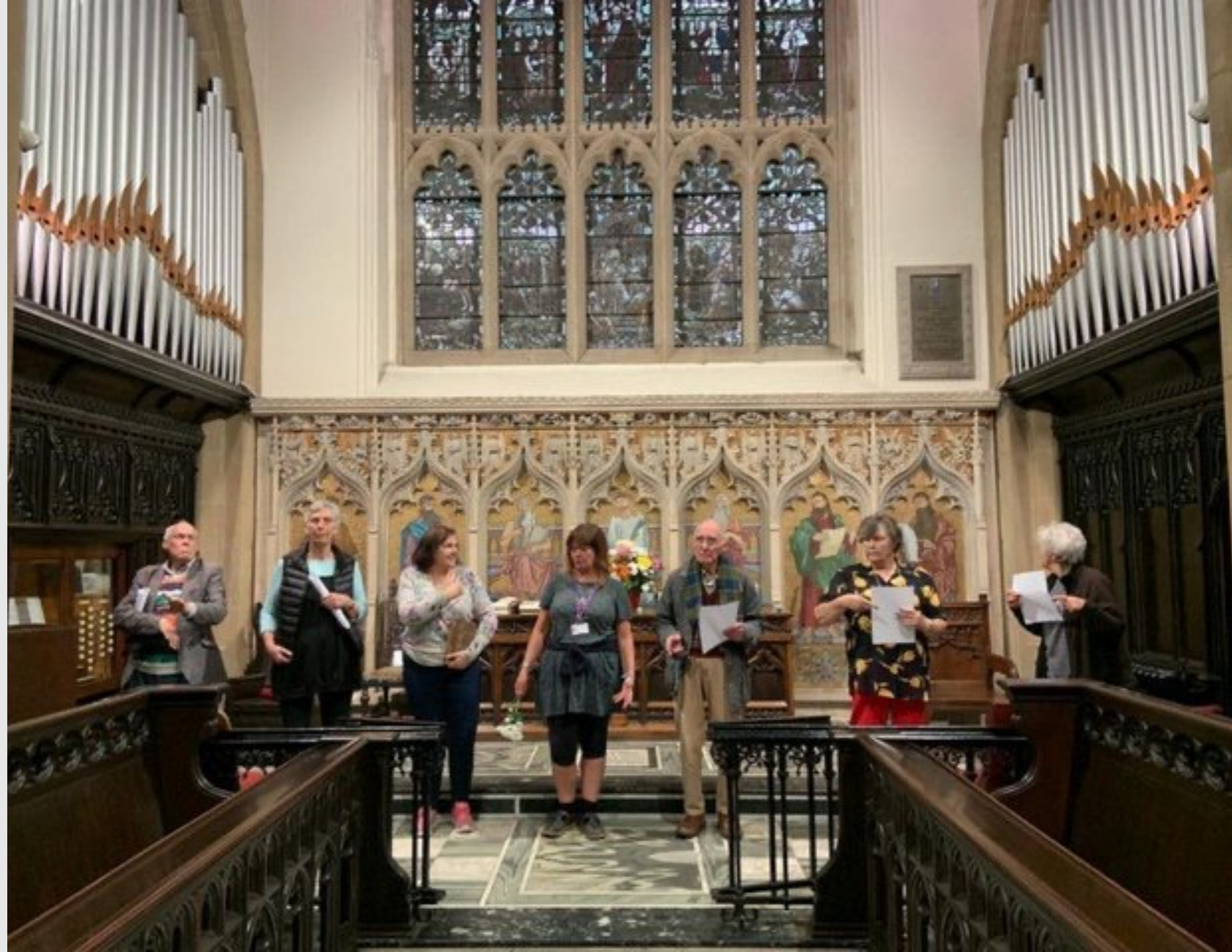
Members of the CINAGE: Live project performing Talkin' Bout My Generation in Leeds.