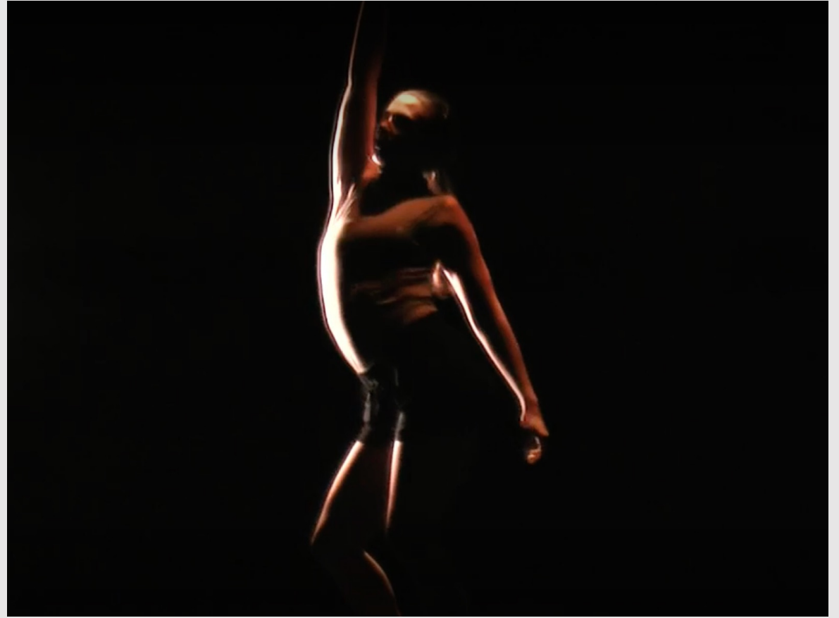
Stills from film of Intusception performed at Hull Truck Theatre