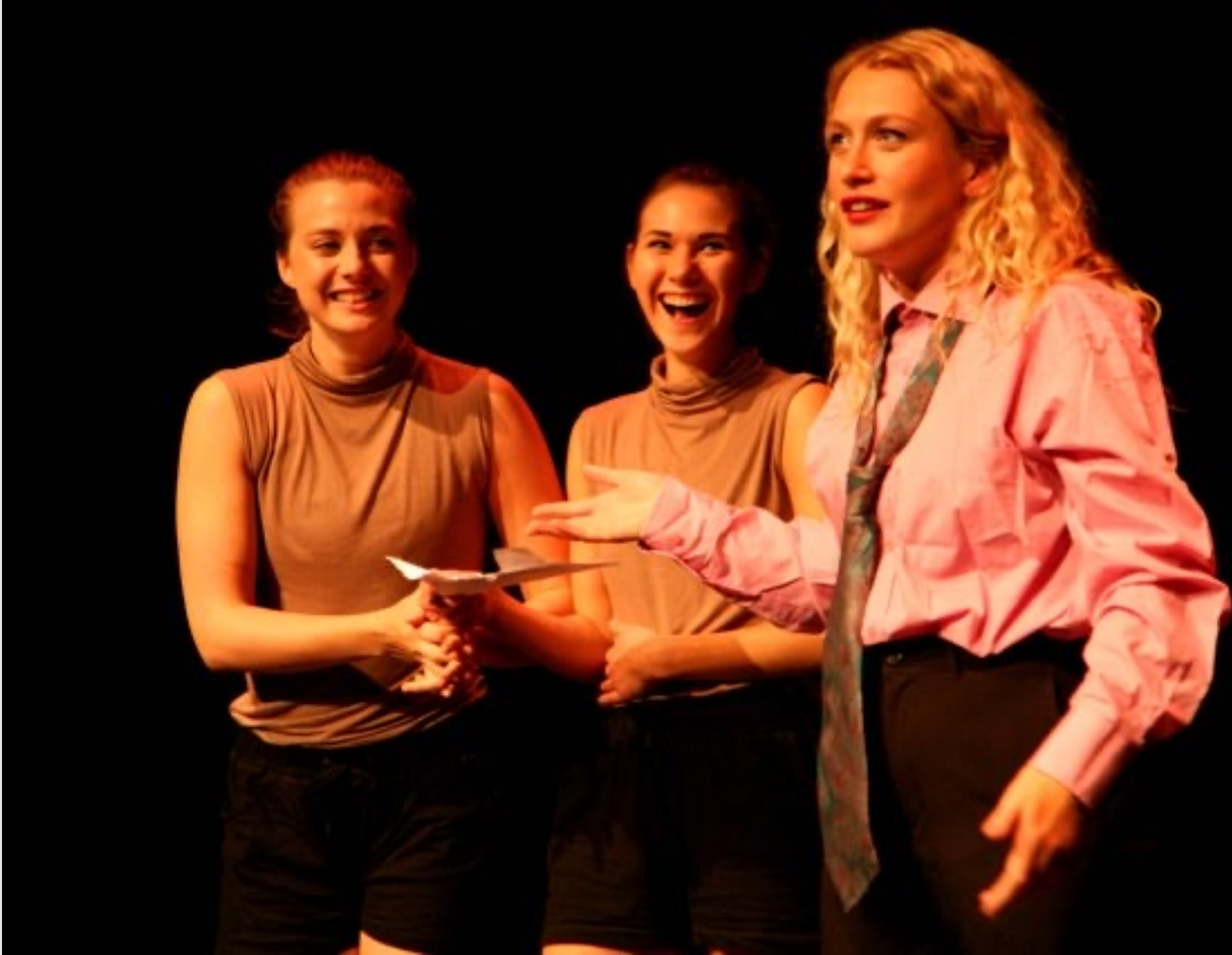
Winning the Hull Dance Prize at the Hull Truck Theatre