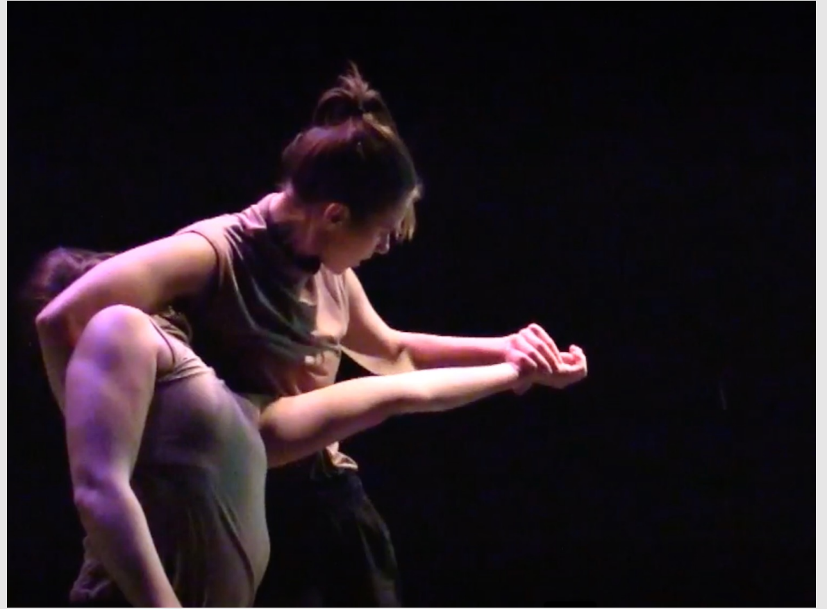
Stills from film of Intusception performed at Hull Truck Theatre